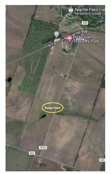
Overview of flying site

The primary housing location for competitors and team supporters will be in student housing located on the campus of Southwestern University in Georgetown, Texas, approximately 34 miles (55km) from the flying site. Cafeteria-style breakfast and dinner choices will be available for participants who choose this housing option. Participants who prefer more traditional hotel arrangements will have the opportunity to choose from many options offering a wide range of amenities and prices.